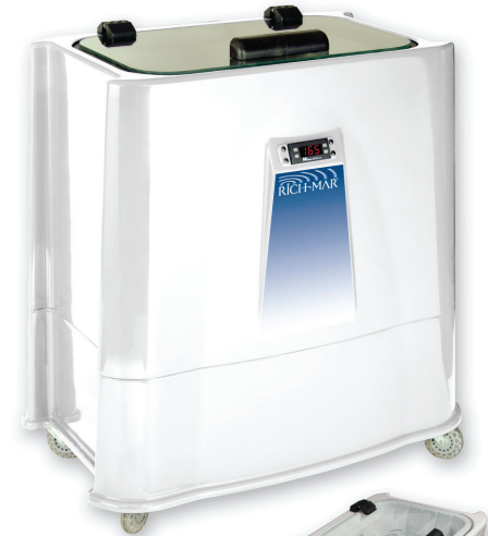
Fully Composite Inside and Outside! Patent Pending